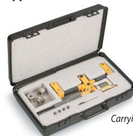
Carrying case available.

Dillon also manufactures highly accurate tension meters, mechanical dynamometers and crane scales.