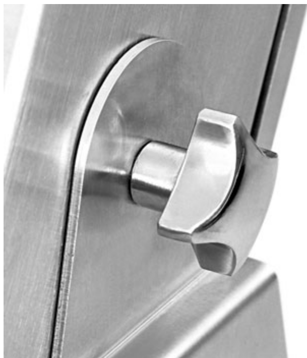
STAINLESS steel inclination adjustment system